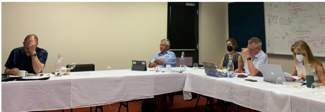
Water Justice Hub workshop