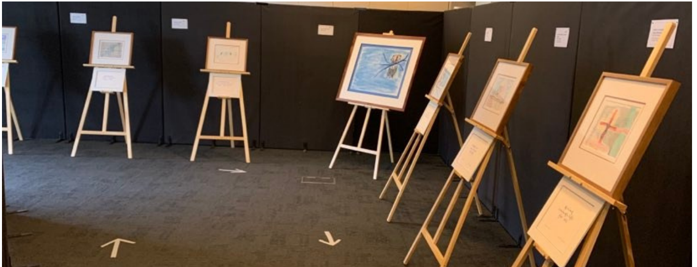
The 'Aquawhen II?' exhibition

We acknowledge and celebrate the First Australians on whose traditional lands we meet, and pay our respect to their elders past and present.